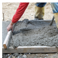
Driveway / Sidewalk Contractors